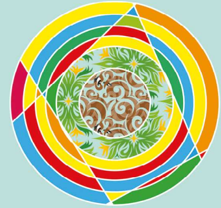
Cells - Radient

Sciences of our own existence. May the day come that peace is like the sun, pervading all.